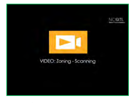
Length of video: Approximately 12 seconds

As a child leaves your zone, communicate with the other staff members to let them know that someone is joining their area. This also helps children move around the classroom more appropriately and maintain their engagement during the day.