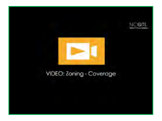
Length of video: Approximately 2 minutes and 9 seconds