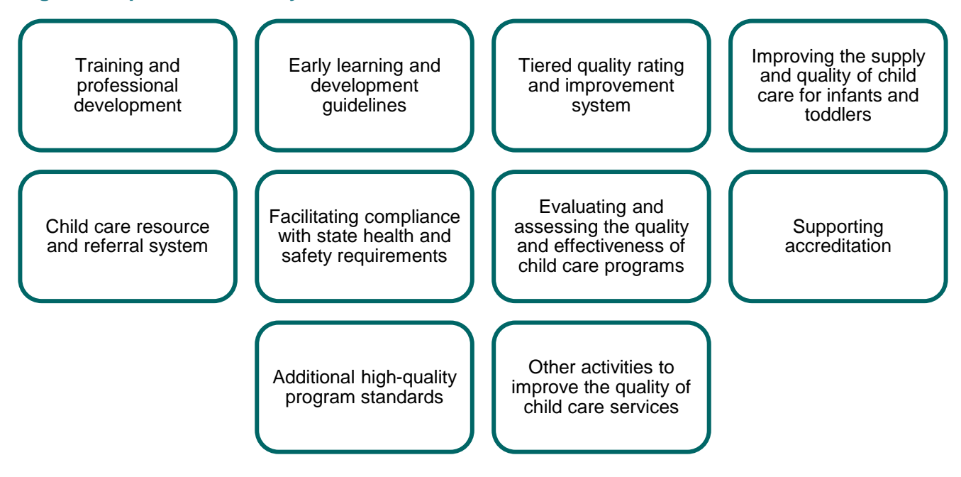
Figure 1. Options for Quality Activities

"The CCDBG Act and CCDF final rule require states to fund at least one of the following 10 quality activities that will improve the quality of child care services provided in the state" (Office of Child Care, n.d., para. 1). The following approved quality improvement activities provide opportunities for new or expanded investments in social-emotional supports (see figure 1).